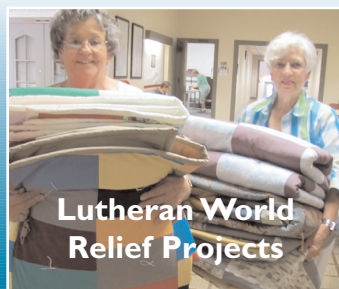
Lutheran World Relief Projects