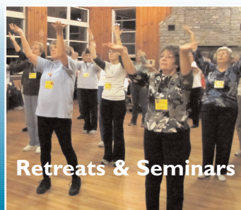
Retreats & Seminars